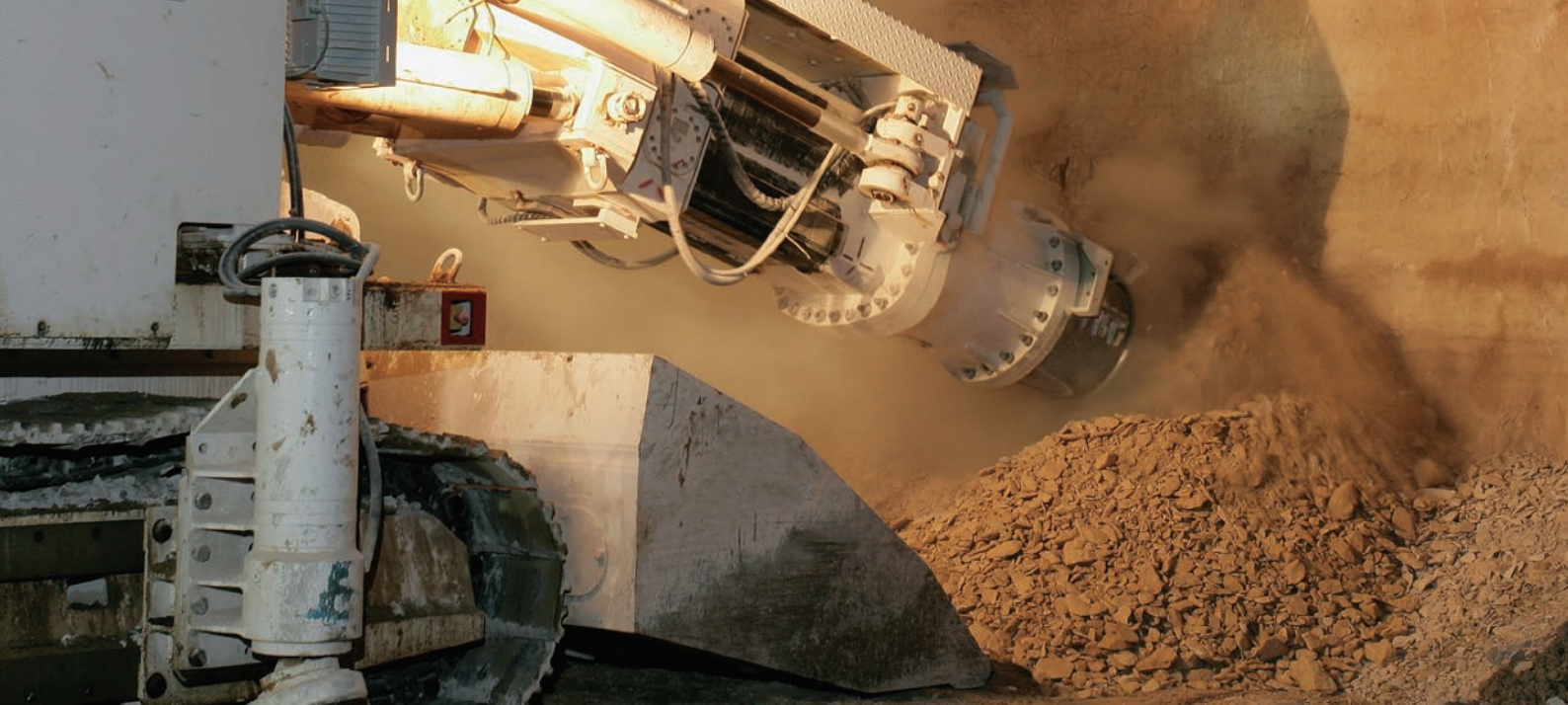
Eight roadheader machines have excavated more than 1.2 kilometres of tunnel.