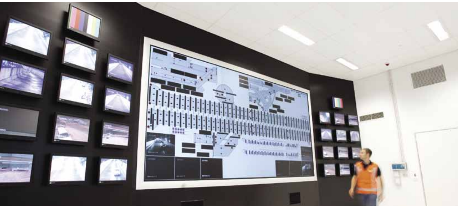
The tunnel is monitored 24 hours a day at the Tollway Control Centre.